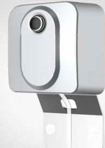
Temperature Measuring Instrument